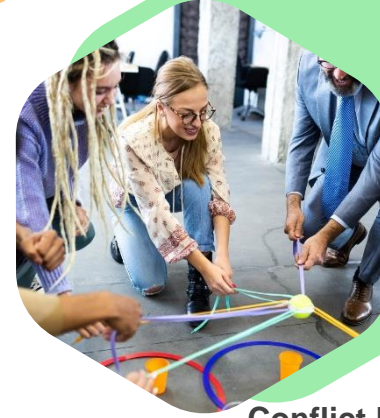
Photo 3 Conflict Management (5 construction simulation games)