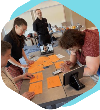
Photo 1 Body Language and Presentation Skills (10 small and big team bond games)