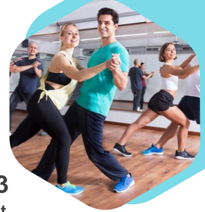
Photo 4 Zumba Dance Class in team