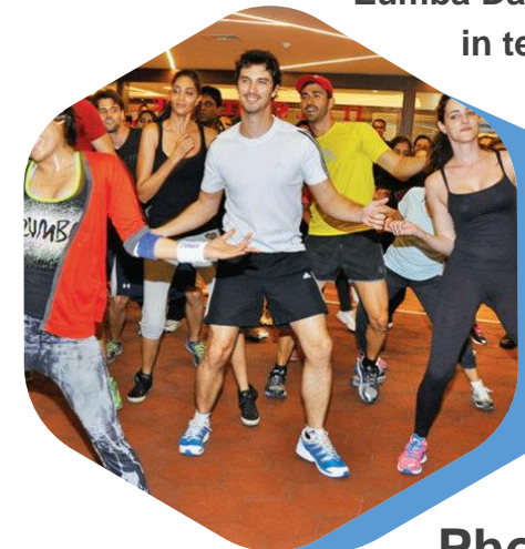
Photo 8 Synchronized dance Class