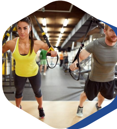
Photo 6 TRX Class