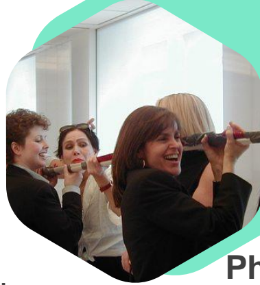
Photo 2 Emotional Intelligence (10 construction simulation games)